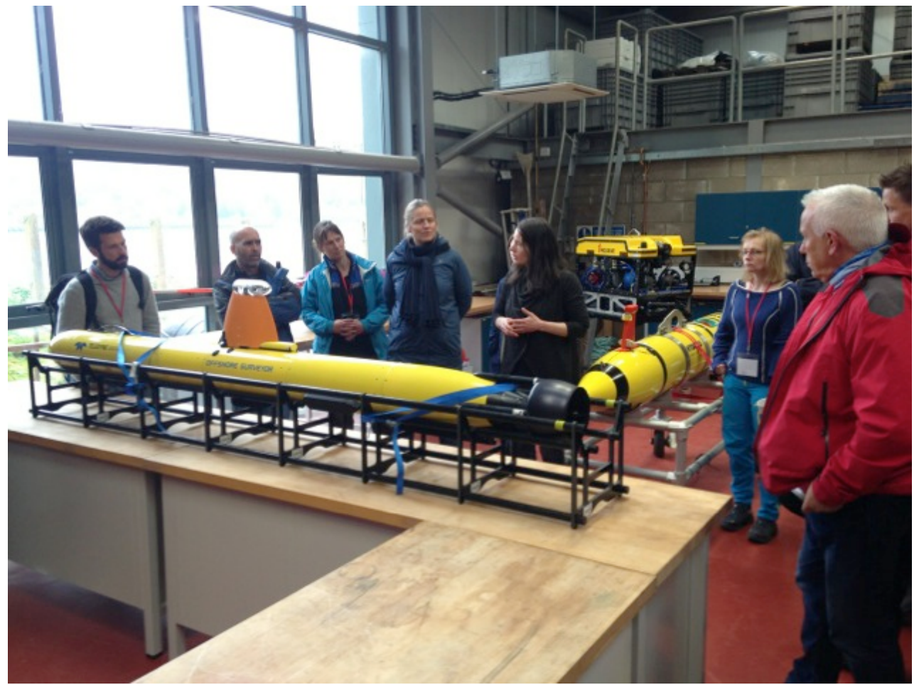
Arctic ABC team visiting the robotics lab at SAMS.

Further details regarding development circulated among the Arctic ABC team. The next milestone is a scheduled meeting at NTNU 19-20 August, during which we will go in detail on the development and implementation plan for ICE POPEs 1-4.